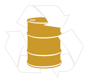
When steel drums and pails have outlived their useful lives, they can be shredded into scrap and recycled into new steel.